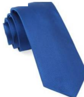
Tie – Blue