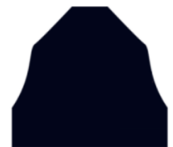
Armband – Senior

Navy Blue Trousers (can be purchased from BBA Shop or from another retailer like Noone)