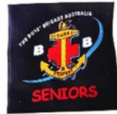
Woven pocket crest