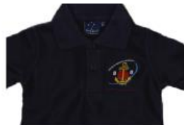
Boys Embroidered Navy Polo Shirts