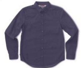
Shirt – Blue Long Sleeve