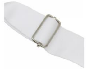
Shoulder Belt White