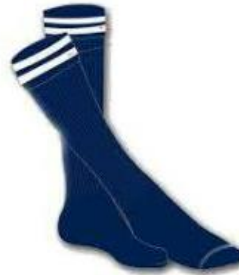
BB Long Socks