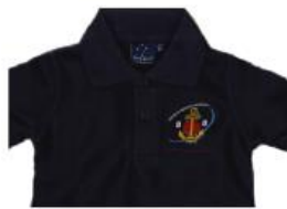
Boys Embroidered Navy Polo Shirts