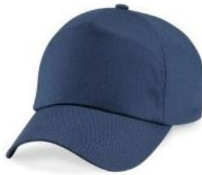
Base Ball Cap Blue