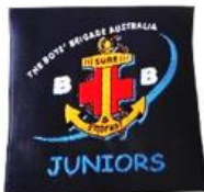
Woven Junior pocket crest